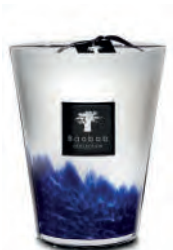
Feathers Touareg Mint - Jasmine - Musk Menthe - Jasmin - Musc