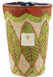
Toliary Mint – Vetiver – Ylang Ylang Menthe – Vétiver – Ylang Ylang