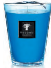
Nosy Iranja Sea Mist - Fig Leaves Embruns Marins - Figue