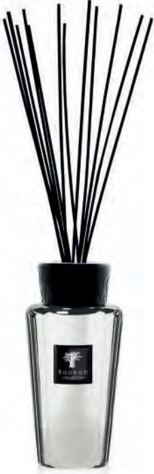
Lodge fragrance 500 ml