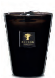
Encre de Chine Century Wood - Jasmine Bois Centenaire - Jasmin