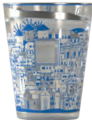
Mykonos Basil - Jasmine - Patchouli Basilic - Jasmin - Patchouli