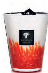
Feathers Maasai Patchouli - Rum Accord - Amber Patchouli - Rhum - Ambre