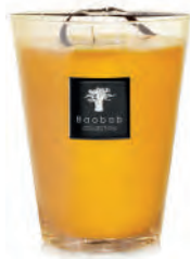
Zanzibar Spices Cinnamon - Turmeric Cannelle - Curcuma