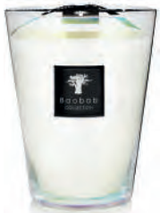
Madagascar Vanilla Frangipani - Vanilla Frangipanier - Vanille