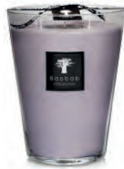
White Rhino Sandalwood - Vetiver Santal - Vetiver