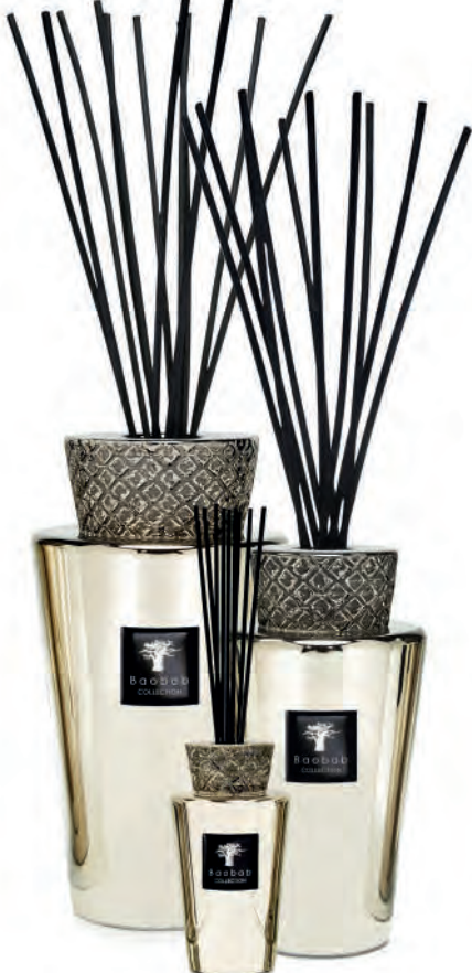
Totem Mini 250 ml - Medium 2 L - Large 5 L