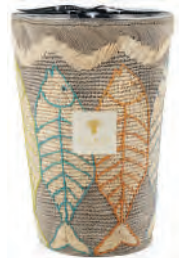
Anosy Orchid – Salt Flower – Ylang Ylang Orchidée – Fleur de Sel – Ylang