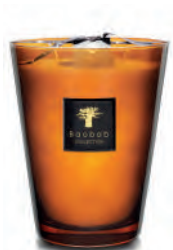
Cuir de Russie Vetiver - Suede Leather Vétiver - Cuir