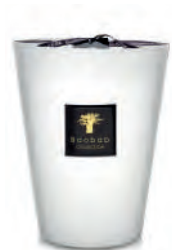
Pierre de Lune White Tea - Frosted Mint Thé Blanc - Menthe Givrée