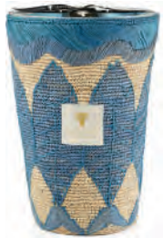
Betany Vetiver – Sea Salt – Amber Vétiver – Sel de Mer – Ambre