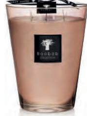
Serengeti Plains Bergamot - Rose Bergamote - Rose