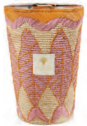
Andriva Orchid – Salt Flower – Ylang Ylang Orchidée – Fleur de Sel – Ylang