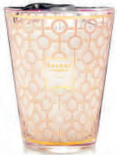
Women Magnolia - Rose - Musk Magnolia - Rose - Musc