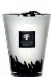
Feathers Saffron - Black Rose - Oud Rose Noire - Bois de Oud - Safran