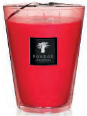
Maasai Spirit Ambergris - Pimento Ambre Gris - Baies de piment