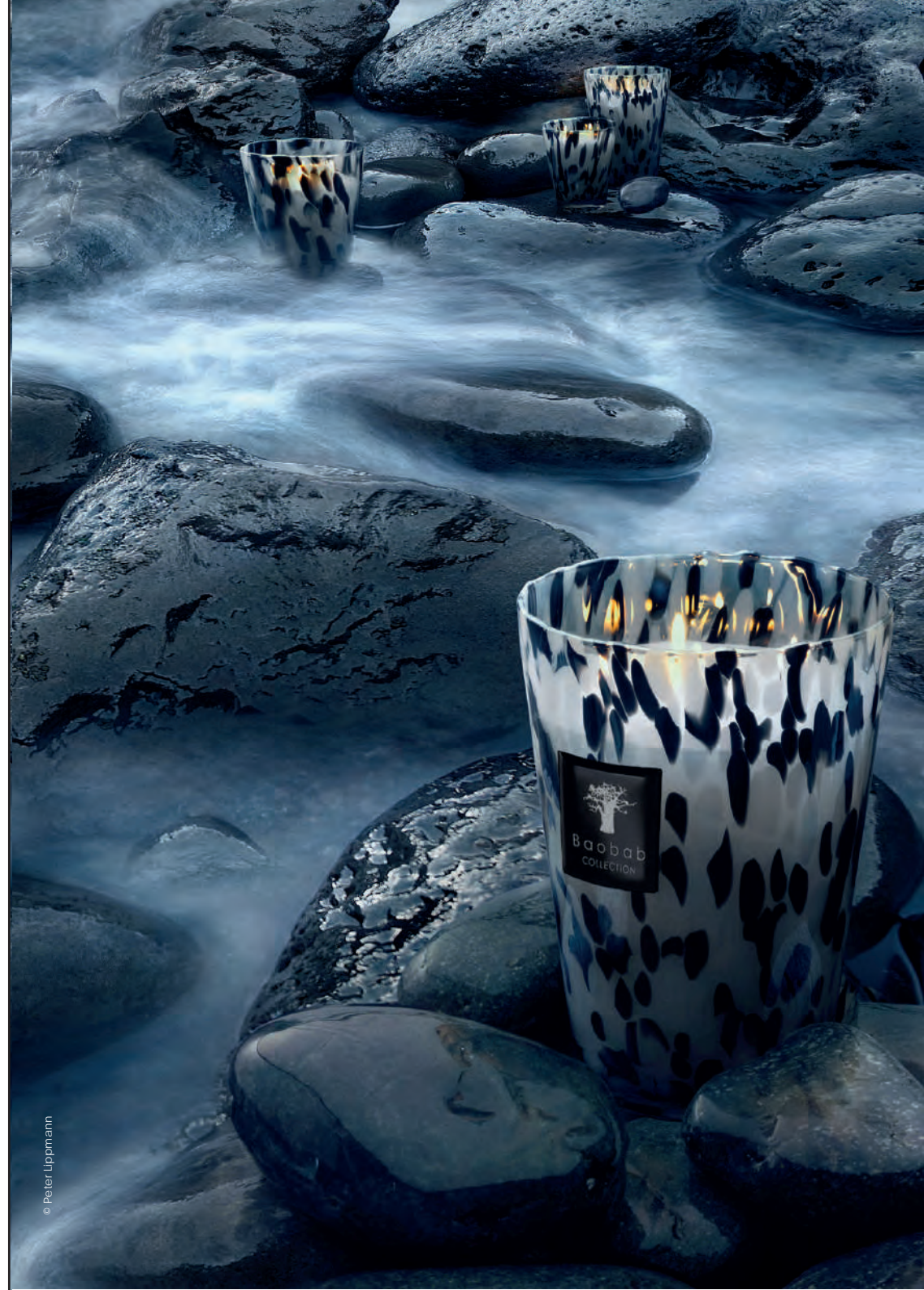
Rose Noire - Gingembre