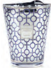
Gentlemen Rum Accord - Saffron - Labdanum Rhum - Safran - Labdanum

Baobab Collection supports BIG against breast cancer.